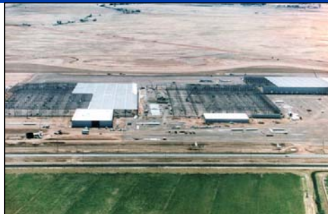
Day #18: Structural steel is 90% erected. Roof and walls are underway.