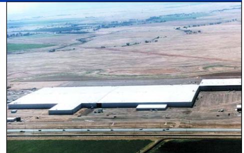
Day #28: The 1.2 million sq. ft. facility is fully enclosed.