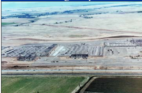
Day #8: Material is staged and erection is underway.